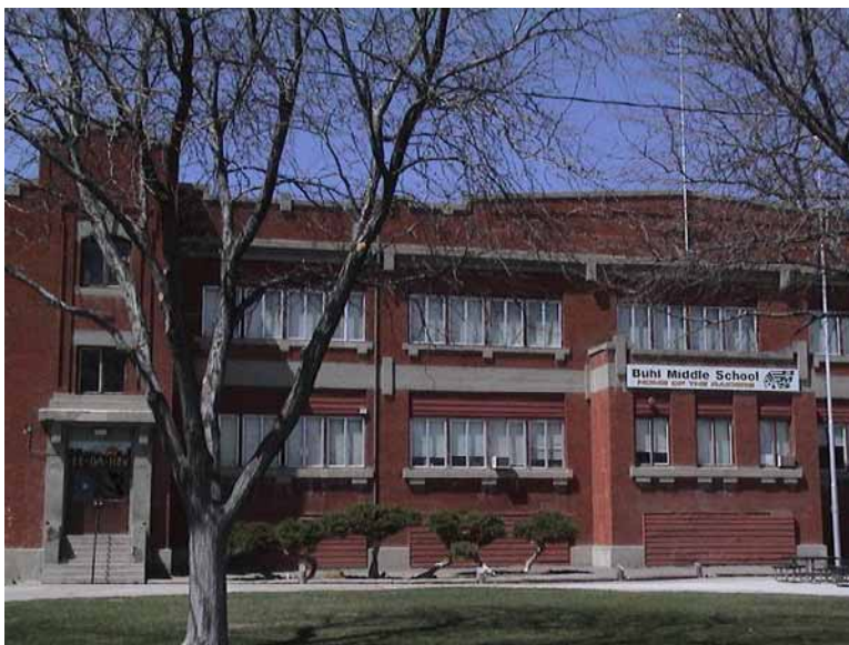
Buhl Middle School

One of Buhl's most important education issues that will be the linchpin for subsequent education-related decision-making in the community is the need to decide soon whether to remodel the middle school or demolish it and build a new school. According to some, this issue has been studied since 1979. If such is the case, it is certainly time to decide. The building does not present an imminent danger that would require its closure, but it does have numerous safety and usability issues.