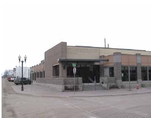
Streetlights enhance Kooskia's Theatre... ...and Weiser's Vendome Community Center

The downtown business core could be more clean and attractive, and immediate future priorities might be convenient parking and a central gathering place. A core downtown area must provide needed products and services at reasonable prices, be pedestrian-friendly for visitors, and be part of a master plan to complement planning and zoning and commercial development on the edge of town.