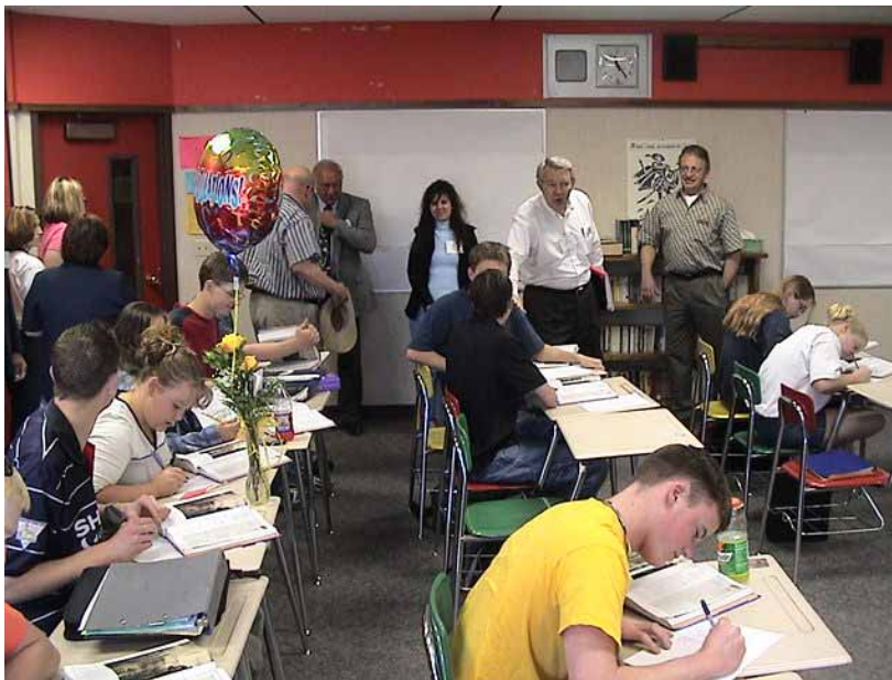
Visiting team members interviewed a number of youth individually and in the classroom setting

As many Idahoans are discovering, creating a youth-friendly city benefits the entire community. Businesses are attracted to cities that place a high value on families and children. Juvenile crime is significantly lowered when youth are actively engaged and perceive that they are valued. Asset-rich youth are less likely to enter the social welfare system, more likely to succeed in school, and will pursue long-lasting career goals and return to their hometown where they give back what they received. Communities that invest in children and youth also see a return on their investment when citizens participate in community service projects and civic improvement initiatives.