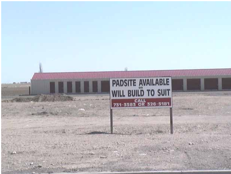
Zoning and signage will continue to be very important to Buhl's future

The downtown business core could be more clean and attractive, and immediate future priorities might be convenient parking and a central gathering place. A core downtown area must provide needed products and services at reasonable prices, be pedestrian-friendly for visitors, and be part of a master plan to complement planning and zoning and commercial development on the edge of town.