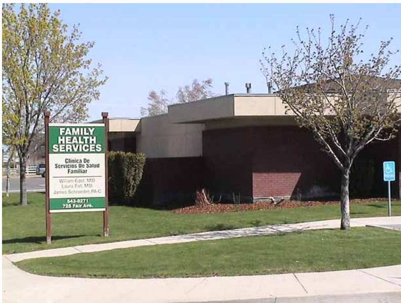
Family Health Services

There are two health clinics in Buhl; the Buhl Medical Center with one doctor and dentist, and Family Health Service, with one doctor and one physician's assistant. Rangen executives mentioned concerns about employees and prospective employees regularly traveling to Twin Falls for routine drug testing. The time incurred traveling to Twin Falls delays hiring new employees by several days and adversely affects company operations. One option might be for Rangen to work with these existing facilities to resolve its concerns, or for companies in the area who require laboratory testing to consider sharing in the cost of hiring an employee or contracting with a service to conduct and evaluate pre-employment tests.