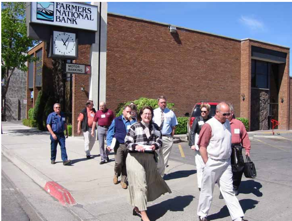
Members of the home and visiting economic development team walk downtown Buhl on May 13, 2002

Buhl's forward progress and effectiveness in achieving its vision of the future will be determined by the will, commitment, planning, and communication of those in the community who hold or assume a leadership role and motivate others to action behind a shared vision. Please call on members of the visiting team, your partners in community development, because we want to support your efforts. Our goal is to increase the wealth and vitality of Buhl and the surrounding region.