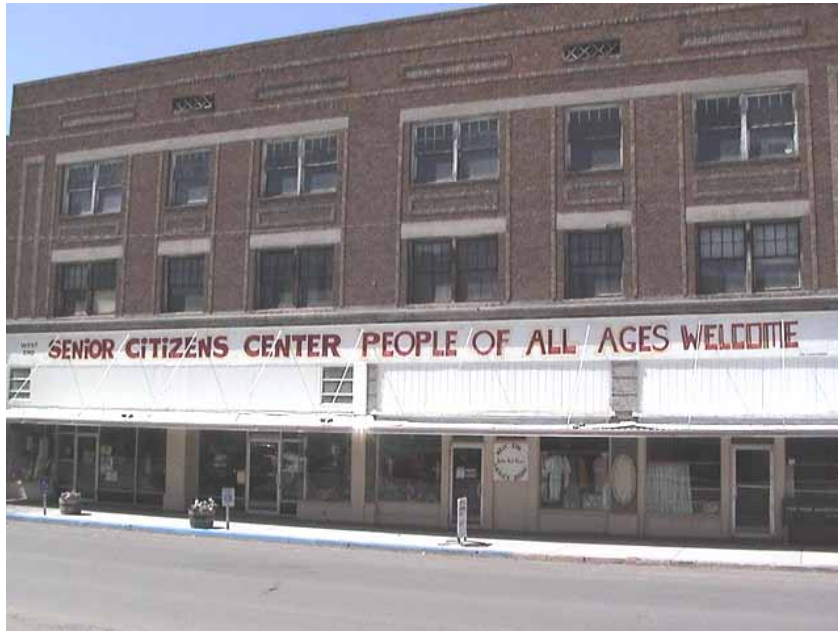
Senior Center at Main and Broadway, downtown Buhl

of a left hand turn off Main Street, and diagonal parking as a traffic hazard. Individuals who responded saw grants/block grants as likely funding sources, or perhaps a local improvement district.