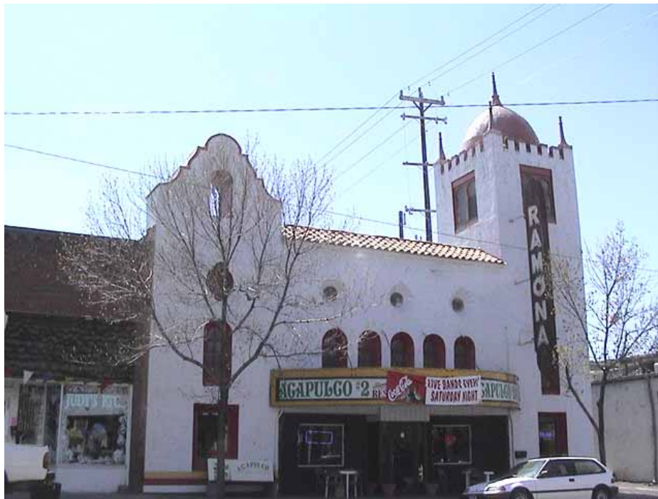
Buhl's Ramona Theater, which opened in 1928, seated 700 and could once again serve as a cultural hub for the community through historic preservation support from the Idaho Commission on the Arts or Idaho Heritage Trust.

Later agriculture included condensed milk in 1927 when depression set in, and Rangen and the first commercial trout farm came along in 1928-29. The first canning and processing came to Buhl in 1944, leading to a long and successful agricultural processing industry.