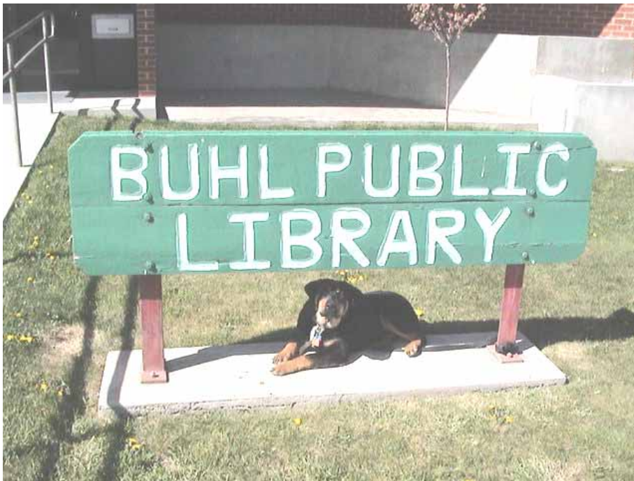
One of Buhl’s many assets (not the dog!) waiting eagerly for increased utilization and recognition