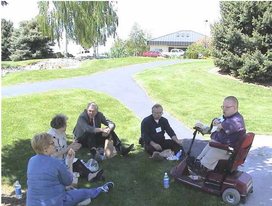
Housing team members break for lunch on the afternoon of May 13, 2002 at the Clear Springs Food Visitor's Center