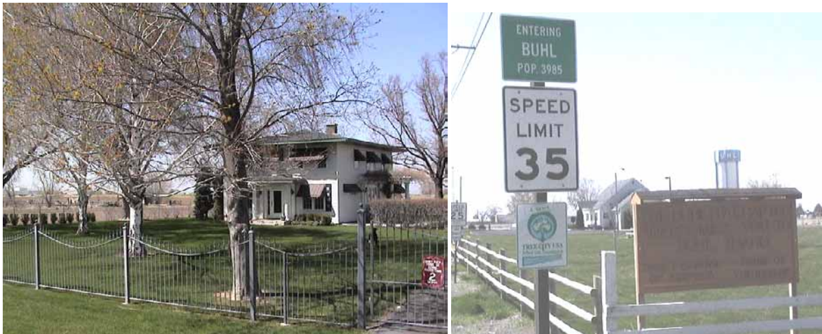
The entryway from Twin Falls and Filer where community development is most active (top) is beautiful and boasts easy access to the Buhl Chamber of Commerce. The entryway into Buhl from popular tourist attraction Balanced Rock (following page) does not create a good impression for visitors at first glance.

The team observed that major entrances into and corridors through the city, such as those from Hagerman and Wendell, need to be enhanced. The eastern approach into Buhl on Highway 30 may be a model of what can be accomplished with vision and effort.