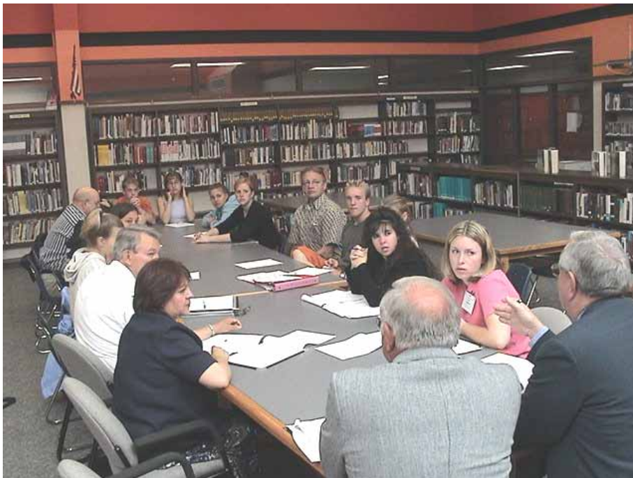
Education home and visiting team members engage with student leaders at Buhl High School on May 13, 2002

Part Three, Community Surveys, Interviews, and Additional Resources , holds additional information related to the review such as the survey data and community interviews collected from community residents, a collection of tools and additional resources such as the community and economic development, business retention, and quality of life survey, and additional resource recommendations.