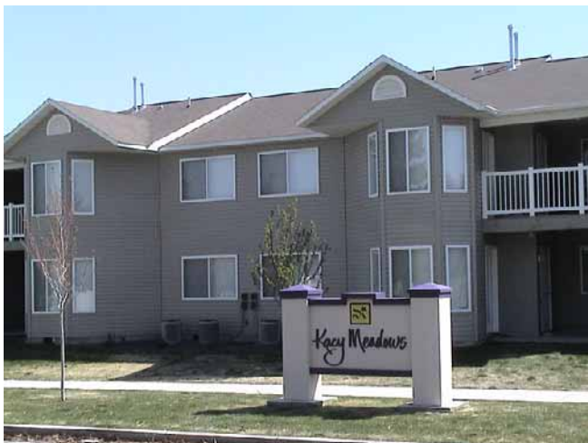
Affordable housing at Kacy Meadows

Through interviews, team members additionally learned that relationships between city government officials and local builders and developers had deteriorated to the extent that they no longer had any interest in building in Buhl.