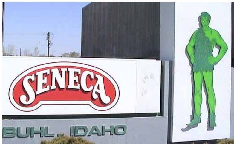
Seneca grows from 100 employees in the off season to 800 during corn pack

The presence of several large industrial companies – Clear Springs, Seneca, and Rangen – is one of Buhl’s many great assets. Any city would be proud to have major employers and good corporate citizens in their community. Numerous businesses spoke at length about their civic pride or were lauded for their community participation and support of critical infrastructure like Head Start. The companies provide a stable employment base, and, for the most part, have a commitment to community involvement. We recommend that the companies, their management, and their employees should be regularly recognized and appreciated for the contributions they make to Buhl and the surrounding area. For that matter, no business in Buhl should be taken for granted. City officials and those responsible for economic development should strive to remain aware of the companies’ challenges and those of their employees, and actively work to address their concerns whenever feasible, while remaining mindful of the needs and concerns of the community as a whole.